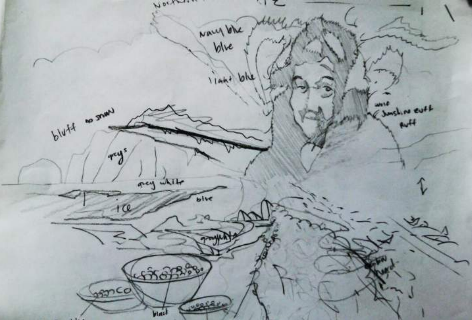
Visioning Meeting - Deering AK